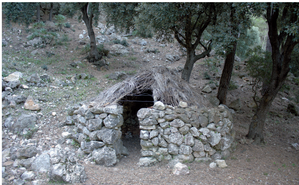
Barraca de carboner al Boal de ses Serveres

“Caminos y paisajes”. Gaspar Valero i Martí