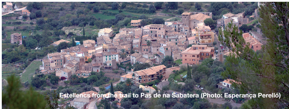
Estellencs from the trail to Pas de na Sabatera