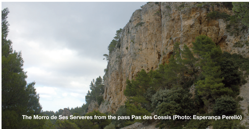
The Morro de Ses Serveres from the pass Pas des Cossis

Nevertheless, he was unable to escape from Mallorca. Caught on his arrival to Palma, he was imprisoned at the Bellver Castle.