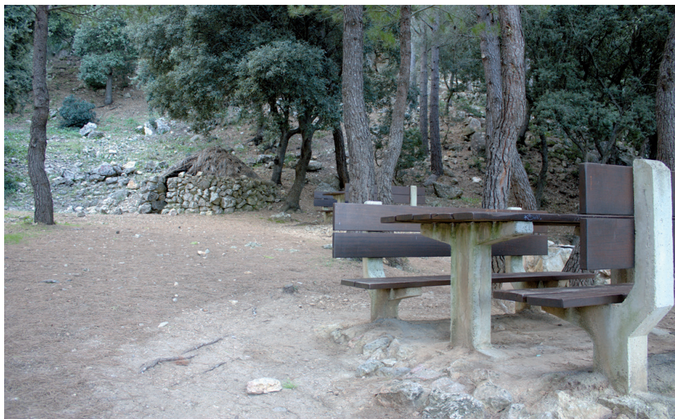
Son Fortuny Recreational Area

You will now turn around to go down the Puig de Galatzó and return along the same path until you reach the pass Pas de na Sabatera. From here, turn left, heading towards Pas des Cossis. From there, it will take you approximately 55 minutes to get back to the Son Fortuny Recreational Area.