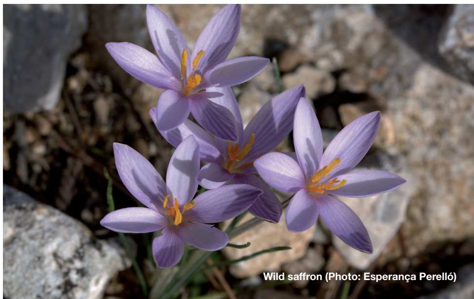
Wild saffron

You may wish to stop here for a moment to note the way the vegetation has changed along the trail. From the lush holm oak forest in the first sections of the hike, you have now come to the landscape typical of the Mallorcan mountains. Here, emerging through the cracks of the stones in the higher section of the trail, you are bound to see wild saffron ( Crocus cambessedesii ) in bloom between October and February.