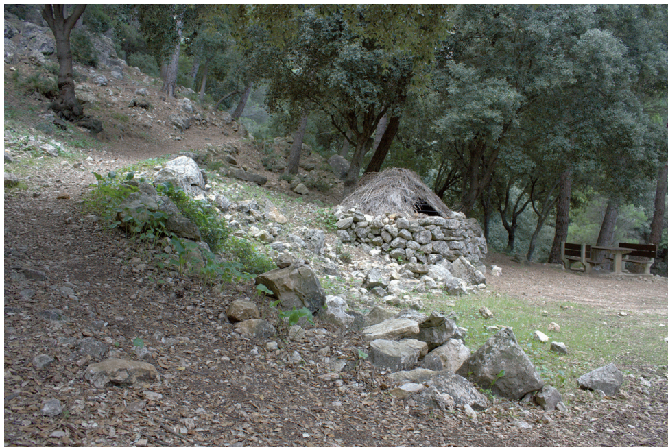
Start of the trail to Pas des Cossis

After an easy climb, a few metres up on the left you will come to the Boal de ses Serveres vantage point. From here on out, the trail is somewhat overrun with Mauritanian grass ( Ampelodesmos mauritanica ), and just a few metres further ahead, it narrows to become a small path that runs along the mountain. Though it will not be difficult to follow the landmarks amid the Mauritanian grass, be careful not to trip over the leaves!