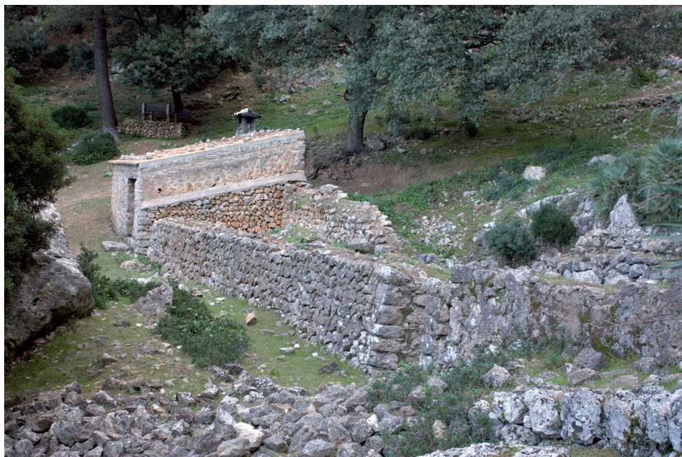
Boal de ses Serveres Refuge

Some 15 minutes later, you will come to a charcoal production floor that sits virtually at the edge of a sheer drop. This is a good place to stop and think about the lives of the men and women who worked in the forests of Tramuntana. You will also enjoy a panoramic view of the municipal area of Estellencs.