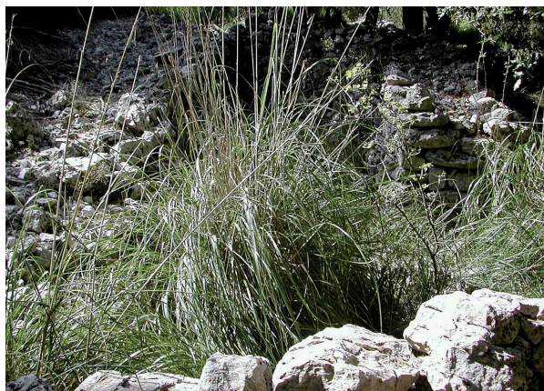
Mauritanian grass

Some 15 minutes later, you will come to a charcoal production floor that sits virtually at the edge of a sheer drop. This is a good place to stop and think about the lives of the men and women who worked in the forests of Tramuntana. You will also enjoy a panoramic view of the municipal area of Estellencs.