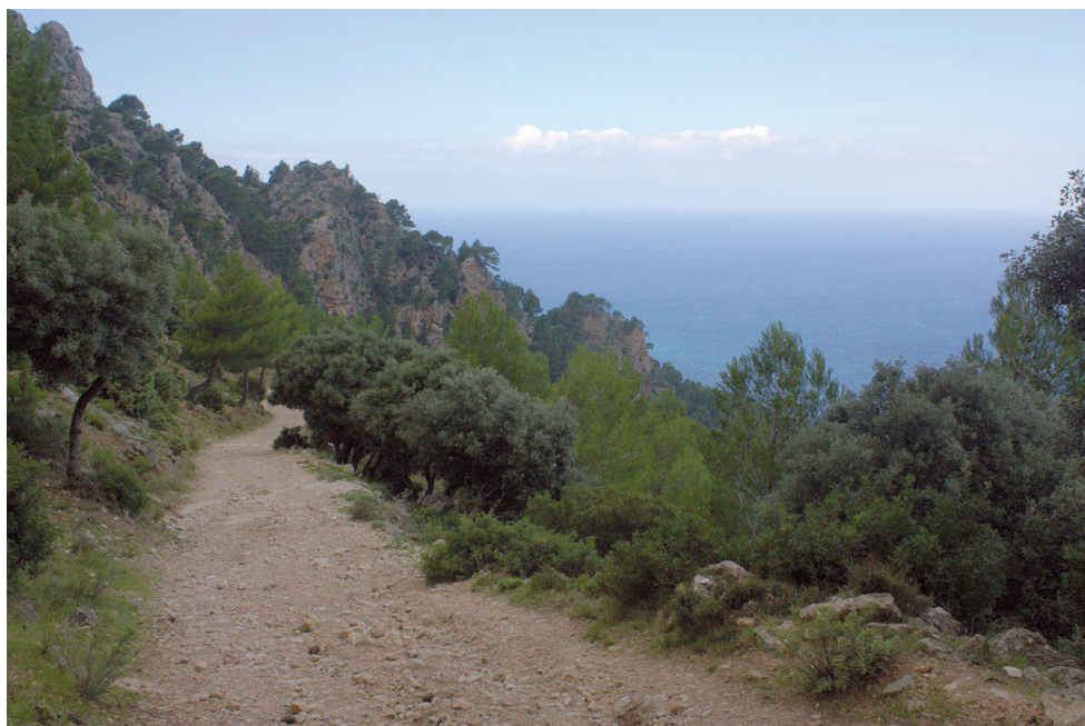
View from the trail leading to the Boal de ses Serveres

After an uphill climb of about 20 minutes, you will come to a plateau with a forest fire prevention water tank. On your right, you will see a trail that leads to the mountain refuge known as the Refugi de la Coma d'en Vidal. Instead, you will take the trail on the left, which will lead to the old stable, Boal de ses Serveres.