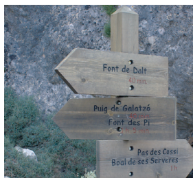
Before the climb to the top

After walking for an hour, and having left behind holm oak and pine groves, you will come to the pass known as Pas de na Sabatera. At this point, you are just a half hour from the top. You need only follow the landmarks. On clear days, this spot offers striking views. Looking to the north, you will see the town of Estellencs and the sea. To the northeast sits the plateau known as Mola de Planícia (920 m); to the east is the valley Vall de Superna, another plateau called the Mola del Ram (820 m) and the towns of Puigpunyent and Galilea; to the southeast, Palma; to the south, the municipal area of Calvià and the plateau Sa Mola del Port d'Andratx; and to the southwest the smaller rise of the Moleta de s'Esclop (926 m). Finally, looking out to the west are the mountains of the Serra des Pinotells and the Moleta Rasa.