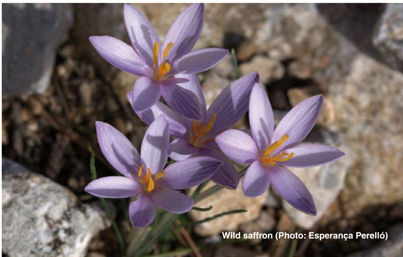
Wild saffron

You may wish to stop here for a moment to note the way the vegetation has changed along the trail. From the lush holm oak forest in the first sections of the hike, you have now come to the landscape typical of the Mallorcan mountains. Here, emerging through the cracks of the stones in the higher section of the trail, you are bound to see wild saffron ( Crocus cambessedesii ) in bloom between October and February.