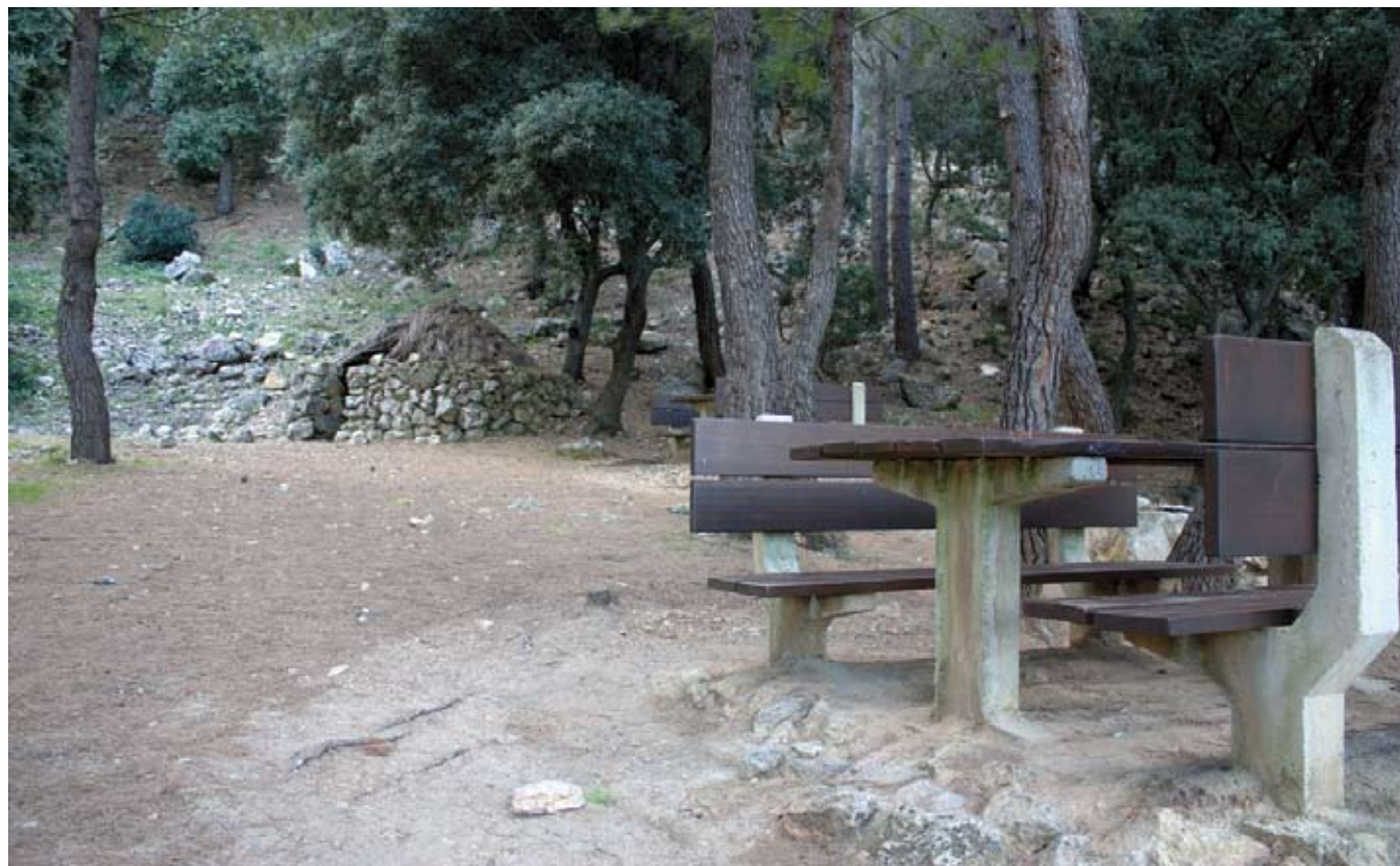
Son Fortuny Recreational Area

You will now turn around to go down the Puig de Galatzó and return along the same path until you reach the pass Pas de na Sabatera. From here, turn left, heading towards Pas des Cossis. From there, it will take you approximately 55 minutes to get back to the Son Fortuny Recreational Area.