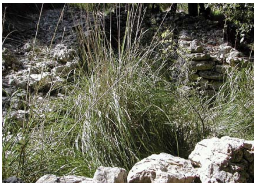
Mauritanian grass

Some 15 minutes later, you will come to a charcoal production floor that sits virtually at the edge of a sheer drop. This is a good place to stop and think about the lives of the men and women who worked in the forests of Tramuntana. You will also enjoy a panoramic view of the municipal area of Estellencs.