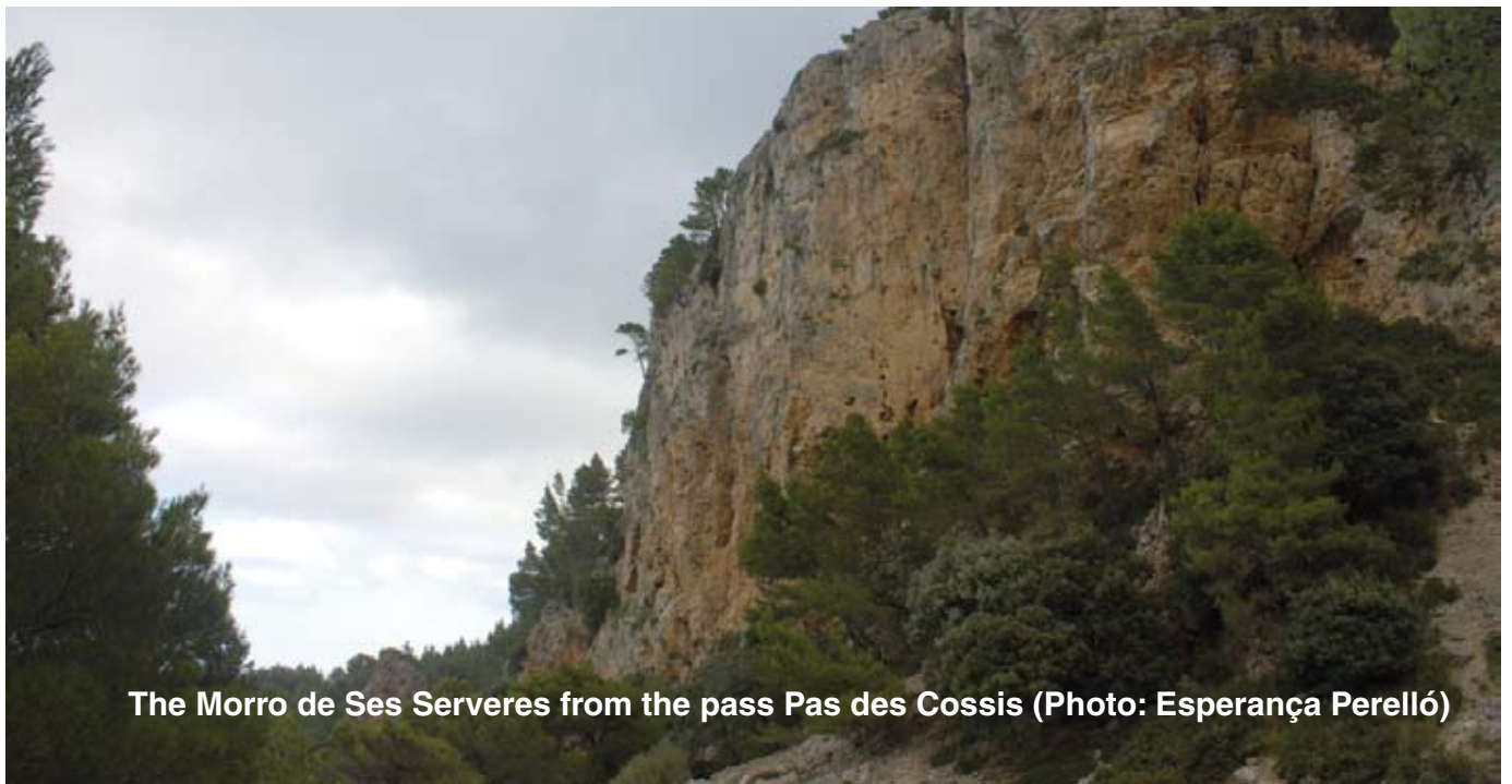
The Morro de Ses Serveres from the pass Pas des Cossis

Nevertheless, he was unable to escape from Mallorca. Caught on his arrival to Palma, he was imprisoned at the Bellver Castle.