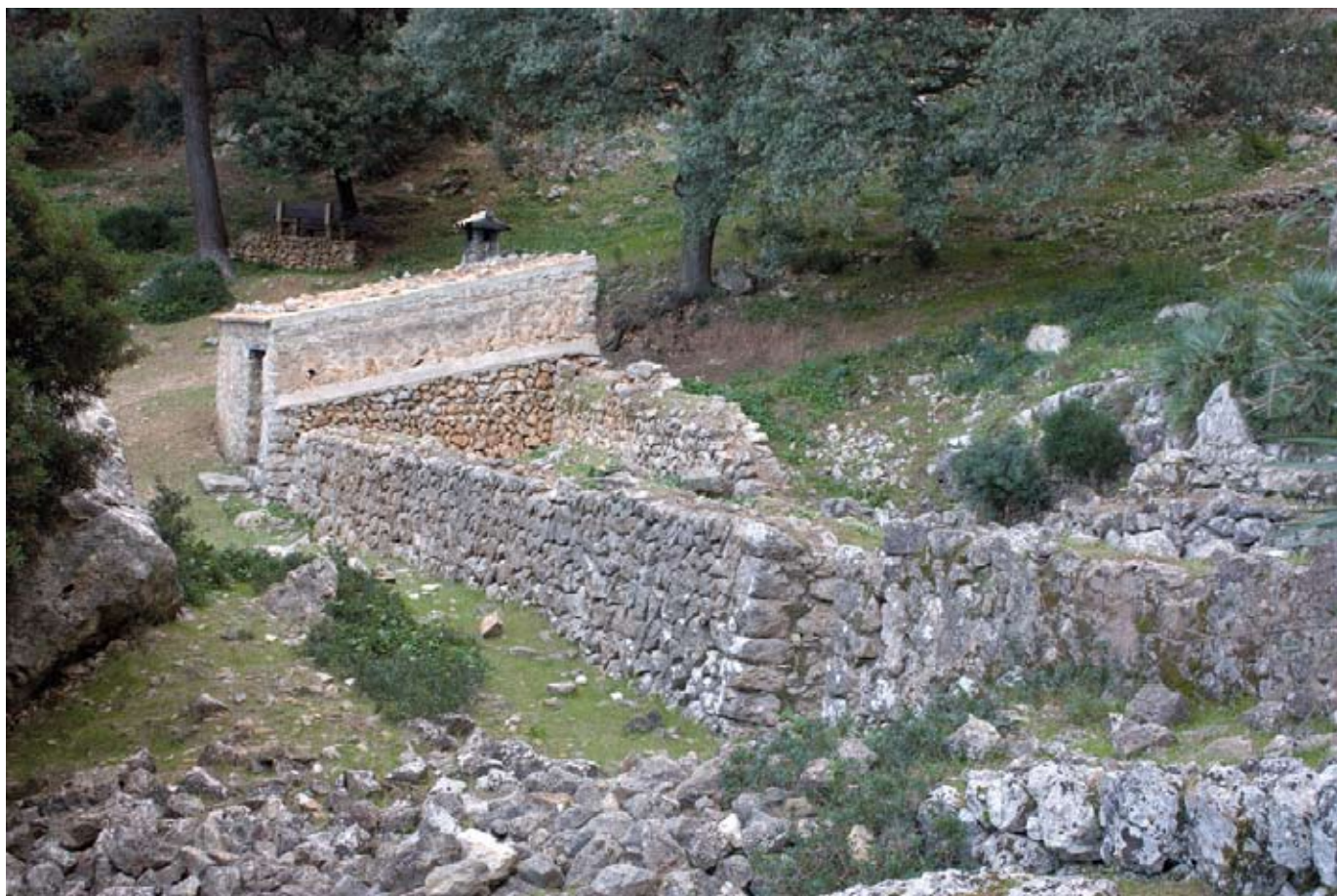
Boal de ses Serveres Refuge

Some 15 minutes later, you will come to a charcoal production floor that sits virtually at the edge of a sheer drop. This is a good place to stop and think about the lives of the men and women who worked in the forests of Tramuntana. You will also enjoy a panoramic view of the municipal area of Estellencs.