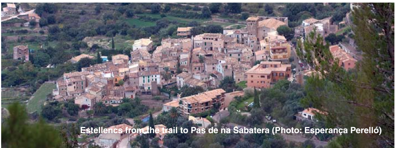
Estellencs from the trail to Pas de na Sabatera