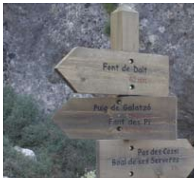
Before the climb to the top

(820 m) and the towns of Puigpunyent and Galilea; to the southeast, Palma; to the south, the municipal area of Calvià and the plateau Sa Mola del Port d'Andratx; and to the southwest the smaller rise of the Moleta de s'Esclop (926 m). Finally, looking out to the west are the mountains of the Serra des Pinotells and the Moleta Rasa.