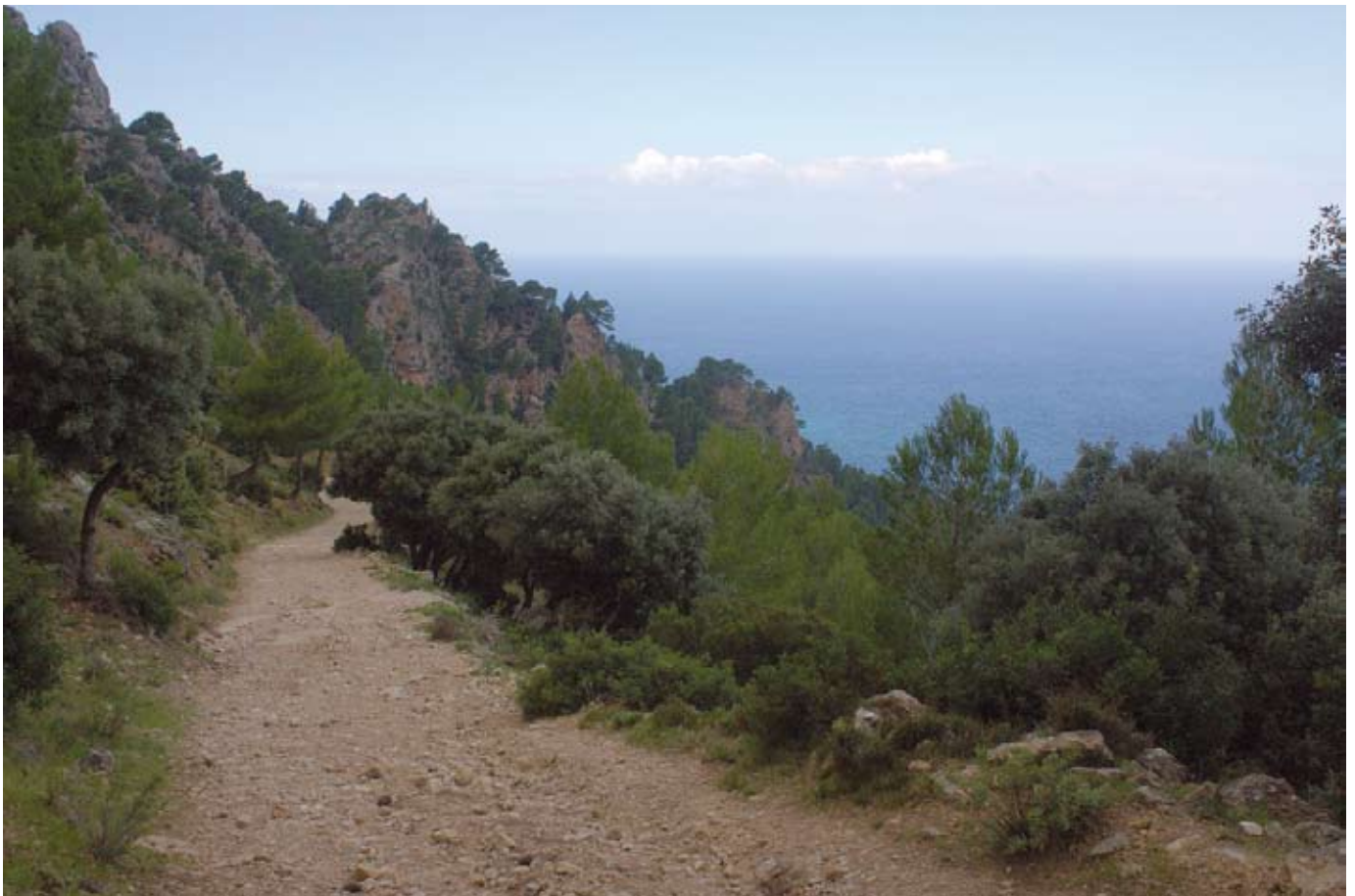
View from the trail leading to the Boal de ses Serveres

After an uphill climb of about 20 minutes, you will come to a plateau with a forest fire prevention water tank. On your right, you will see a trail that leads to the mountain refuge known as the Refugi de la Coma d'en Vidal. Instead, you will take the trail on the left, which will lead to the old stable, Boal de ses Serveres.