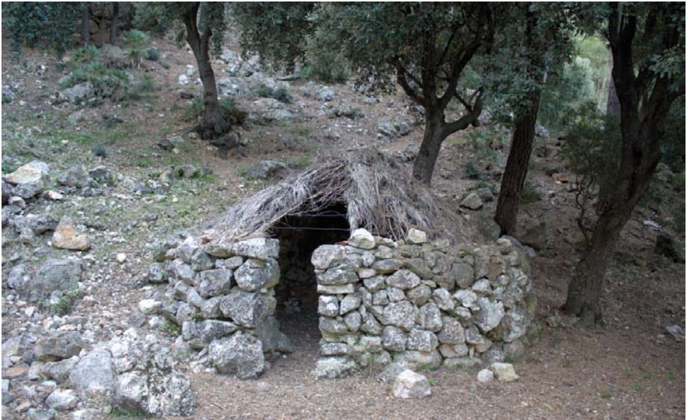
A wood collier's shack

“Caminos y paisajes”. Gaspar Valero i Martí