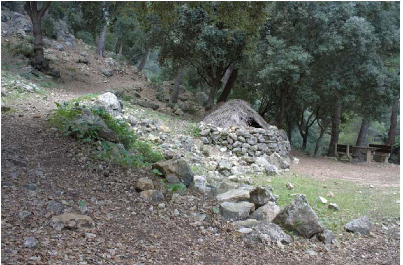
Start of the trail to Pas des Cossis

After an easy climb, a few metres up on the left you will come to the Boal de ses Serveres vantage point. From here on out, the trail is somewhat overrun with Mauritanian grass ( Ampelodesmos mauritanica ), and just a few metres further ahead, it narrows to become a small path that runs along the mountain. Though it will not be difficult to follow the landmarks amid the Mauritanian grass, be careful not to trip over the leaves!