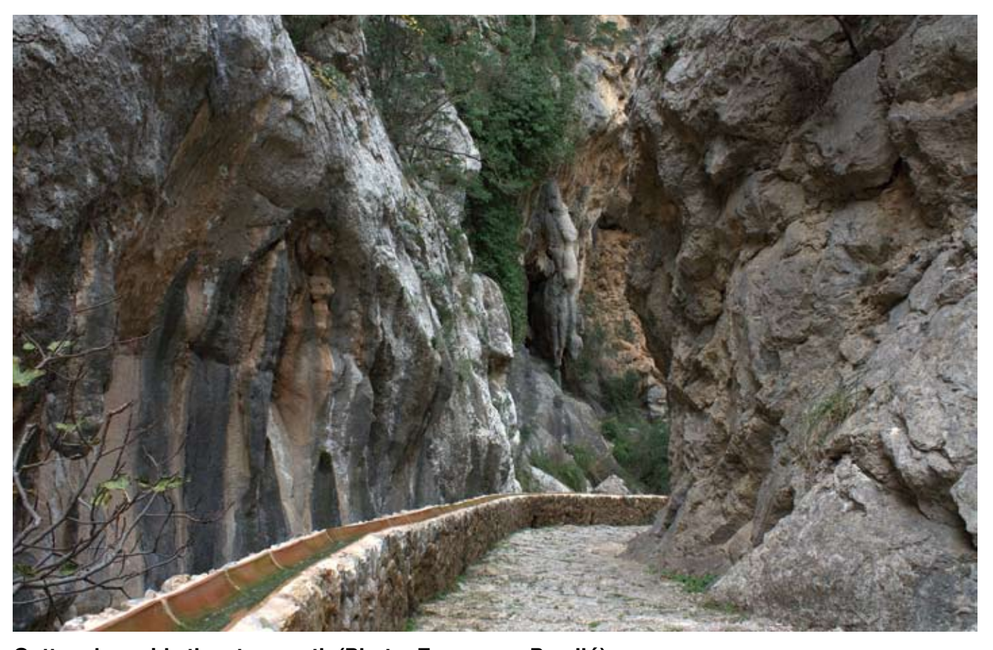
Gutter alongside the stone path

The ditches are long and narrow excavations lined with dry stone that collected the water at the foot of the terrace wall and conducted it to the main stream.