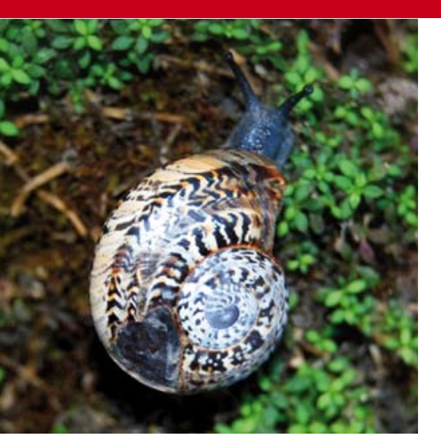
Iberellus balearicus.

The drain channels are underground galleries that were built in places where water tended to accumulate. To build these structures, a part of the soil was removed and a layer of stone was laid in its place, to promote drainage. The soil was then placed on top of the stone, thus enabling the cultivation of the field.