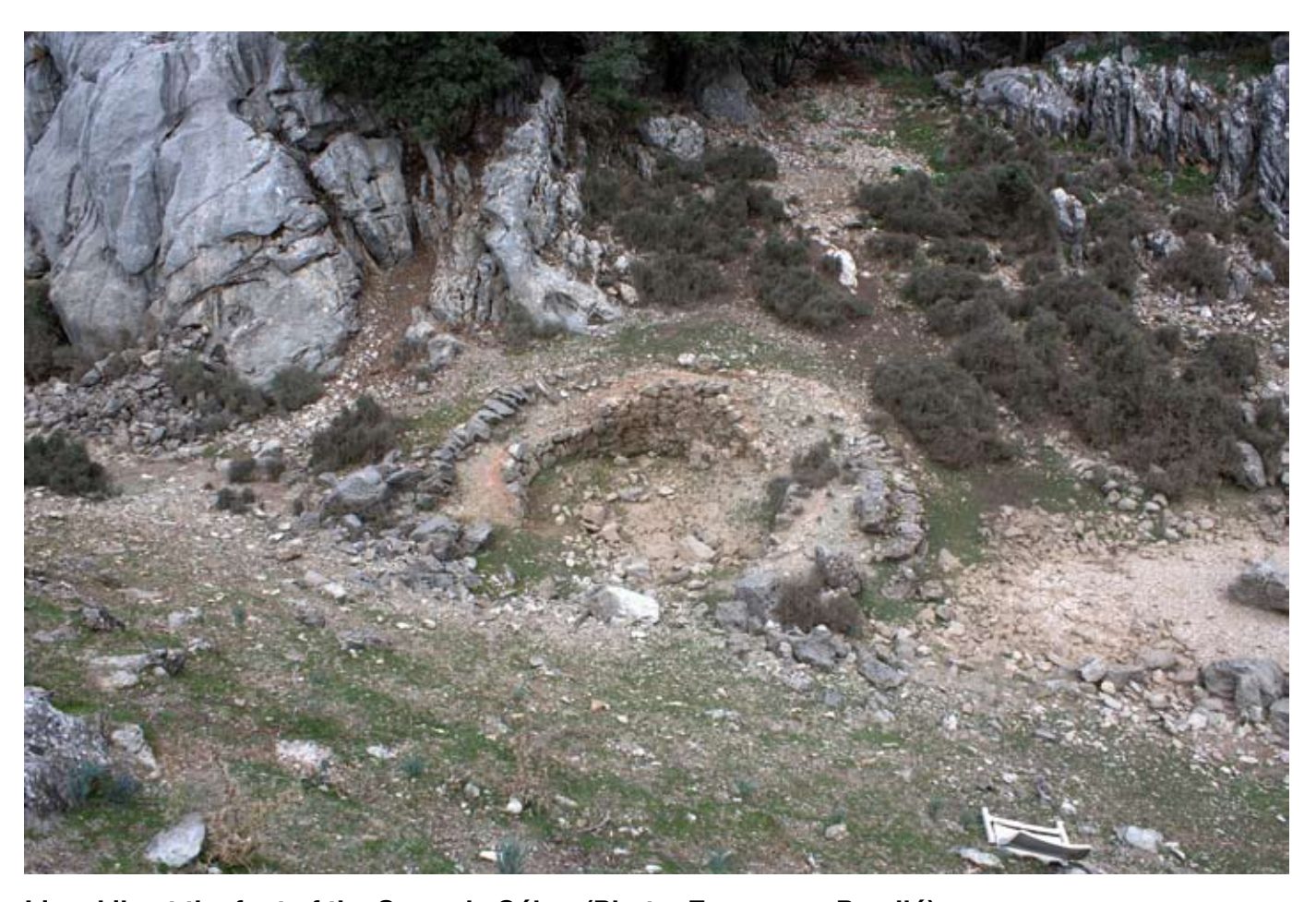
Lime kiln at the foot of the Serra de Cúber

Follow the trail to the right, towards the holm oak grove. Next, you will turn to the left, following the path towards the Puig de l'Ofre (1093 m), which lies in the distance. You will need to come up close enough to the rocks at the side of