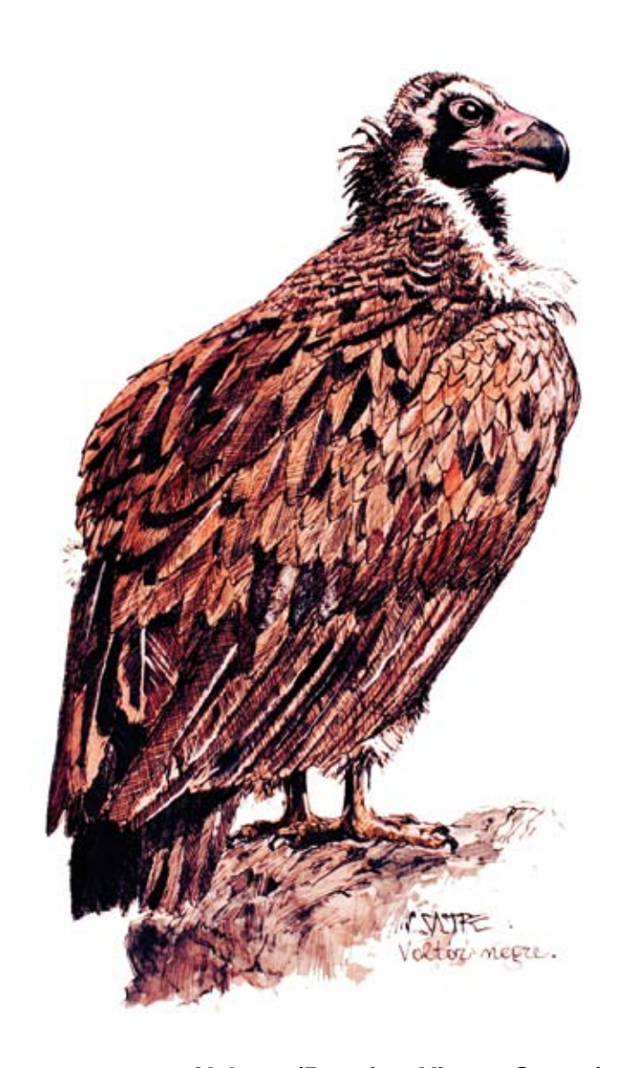
Vulture (Drawing: Vicenç Sastre)

You will also want to remember to look up at the sky from time to time, so as not to miss the striking display of the black vulture in its silent flight. The largest bird of prey in Europe, the black vulture (Aegypius monachus) measures some 100 centimetres in length and has a two-and-a-half-metre wingspan. This bird usually weighs around eight kilos; however, it can come to weigh as much as twelve. Endowed with a great, robust beak, this vulture's plumage is totally black, though more intensely coloured in the younger specimens and