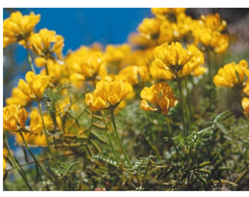
Horseshoe vetch

Shortly after you begin your excursion, on your right, just between the path and the highway, you will see a somewhat jagged rock formation known as Es Cavall Bernat. This name also appears in other areas of the island, and always refers to pointed outcrops. The origin of the name can be explained by the phallic shape that is common to them all. Most probably, the former local expression carall