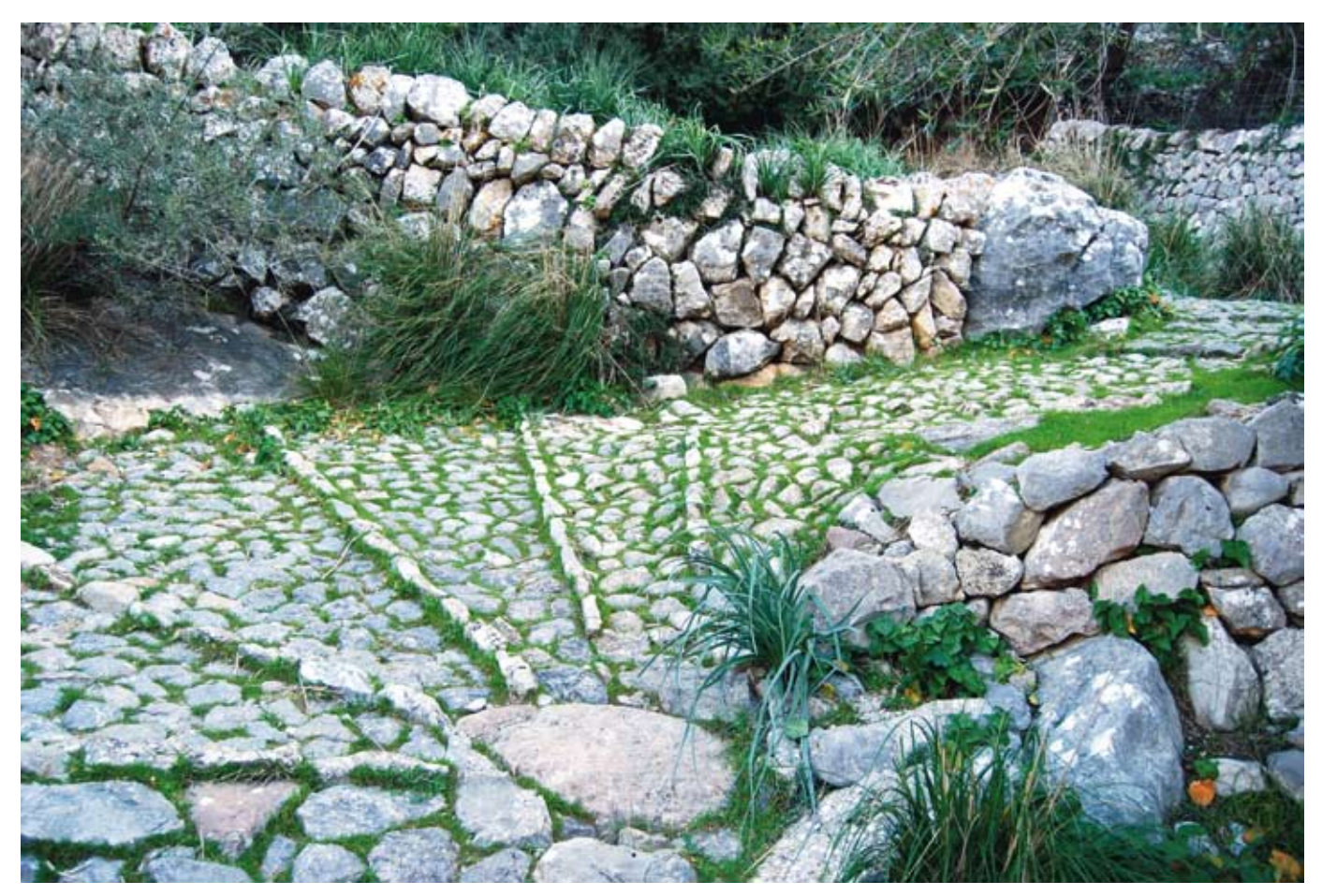
Sa Costa Llarga or Ses Passes de Gegant

Further up, once you have tried your luck at Còdol d'en Seda, you will cross over the Lluc highway and begin to climb Sa Costa Llarga ("The Long Hill"). This is undoubtedly a good place to stop and contemplate the beautiful stone-laid pavement of the primitive road, while resting along your ascent. Along the path, you are sure to notice the ratlletes , or elongated stones that were laid in a slanted position to evacuate the rainwater from the trail, to minimise erosion. Here, because the stairs were placed with such large spaces between them, this path has often been referred to as Ses Passes de Gegant (Giant Footsteps).