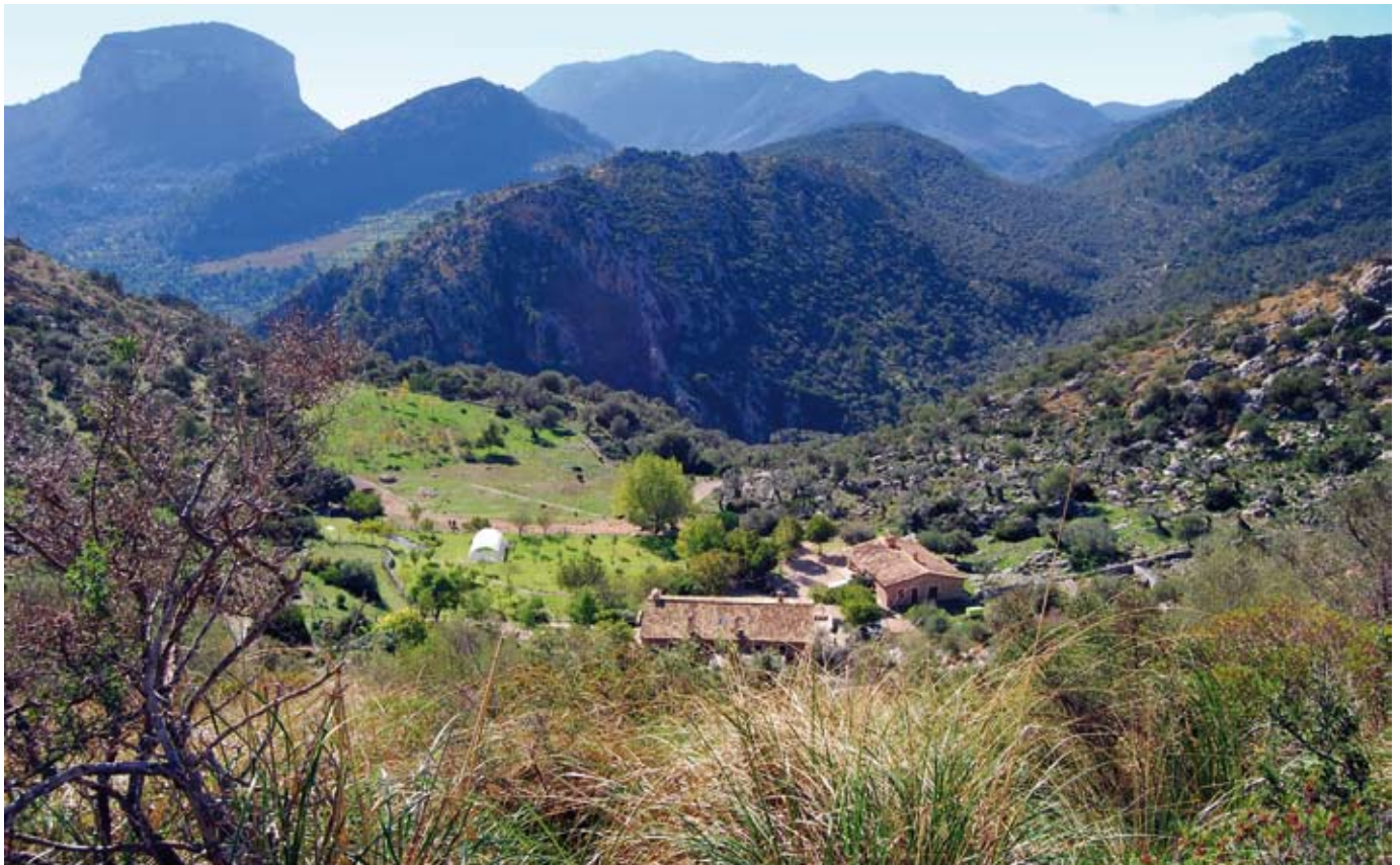
Tossals Verds Refuge

The path will become rockier, with slight uphill and downhill sections, as you reach the Tossals Verds olive grove, a solid example of the fine balance between nature and human activity. You will soon come to a crossroads in front of a crag. Here, turn right and continue alongside a wooden handrail until you reach the Tossals Verds Refuge. Today, the name Tossals refers to the estate, the mountain summit and the estate houses. The word tossal is defined as an “elevated area of land that is not particularly high or steep, located on a plain or isolated from other mountains”. The adjective verds can be attributed to the area’s verdant landscape, thanks to the abundant Mauritanian grass, which has been widely used for shepherding through the ages.