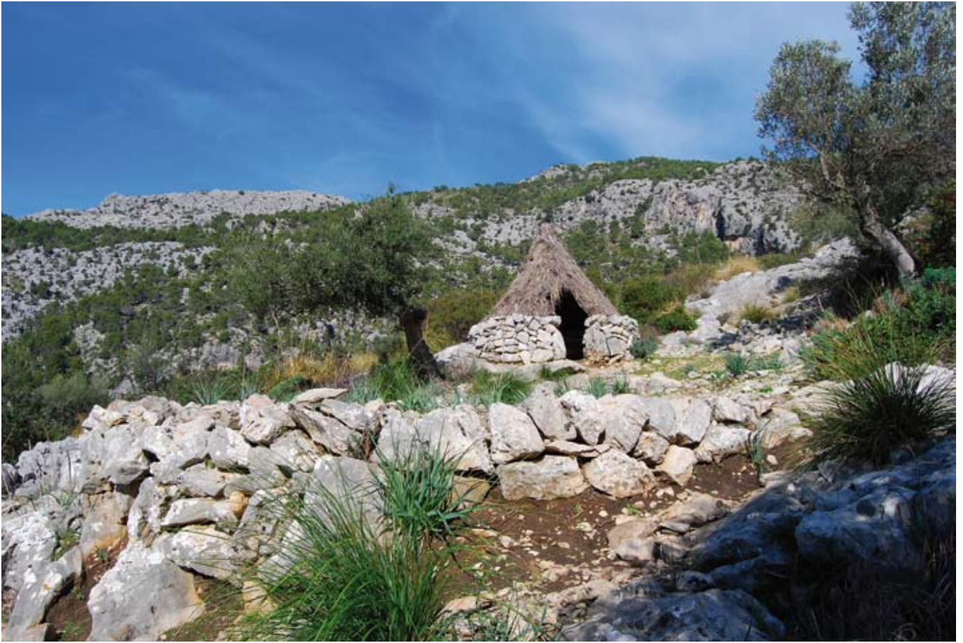
Charcoal production floor and wood collier's shack

The Tossals Verds Refuge, which is managed by the Consell de Mallorca, invites you to take a break. Once you have recovered, follow the signs of the GR-221 towards the spring, Font des Noguer. On the left-hand side of the refuge, you will see the stone-paved path that leads up to an open area, where the old houses, or Cases Velles des Tossals , are located. Yet before you get there, you will pass by a round charcoal production floor ( rotlo de sitja ), where charcoal was once made, and a small shack covered with Mauritanian grass ( A. mauritanica ), which housed the wood collier and his family.