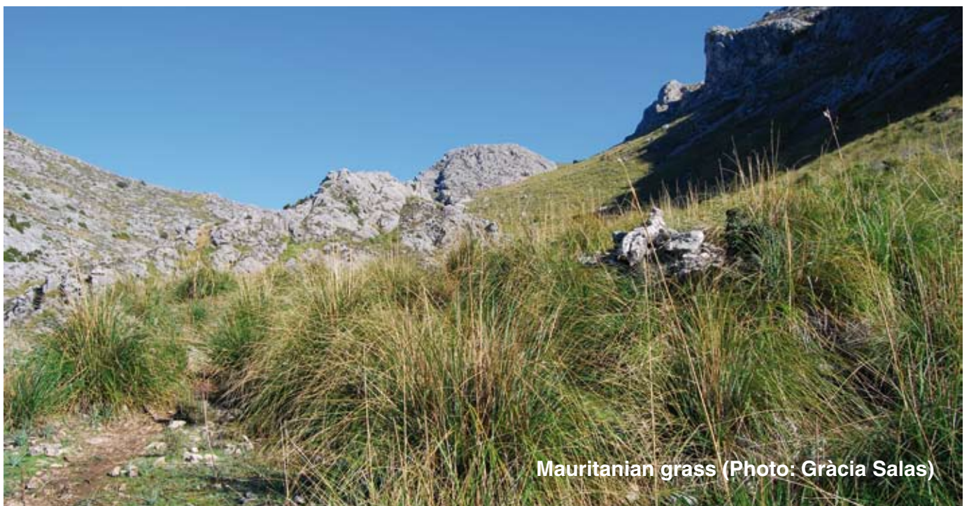
Mauritanian grass

Shortly before you reach the Llis pass, you may wish to stop to look at the local box tree ( Buxus balearica ). This is a surviving member of a plant species that abounded here in the past. Currently listed in the Balearic Catalogue of Endangered Species and Special Protection, this tree can be identified by its shiny oval leaves, which, pale green in colour due to the effects of the wind, take on reddish tones in the summer. The hard, dense wood of this tree was once highly valued for its use in making spoons and even fine furniture.