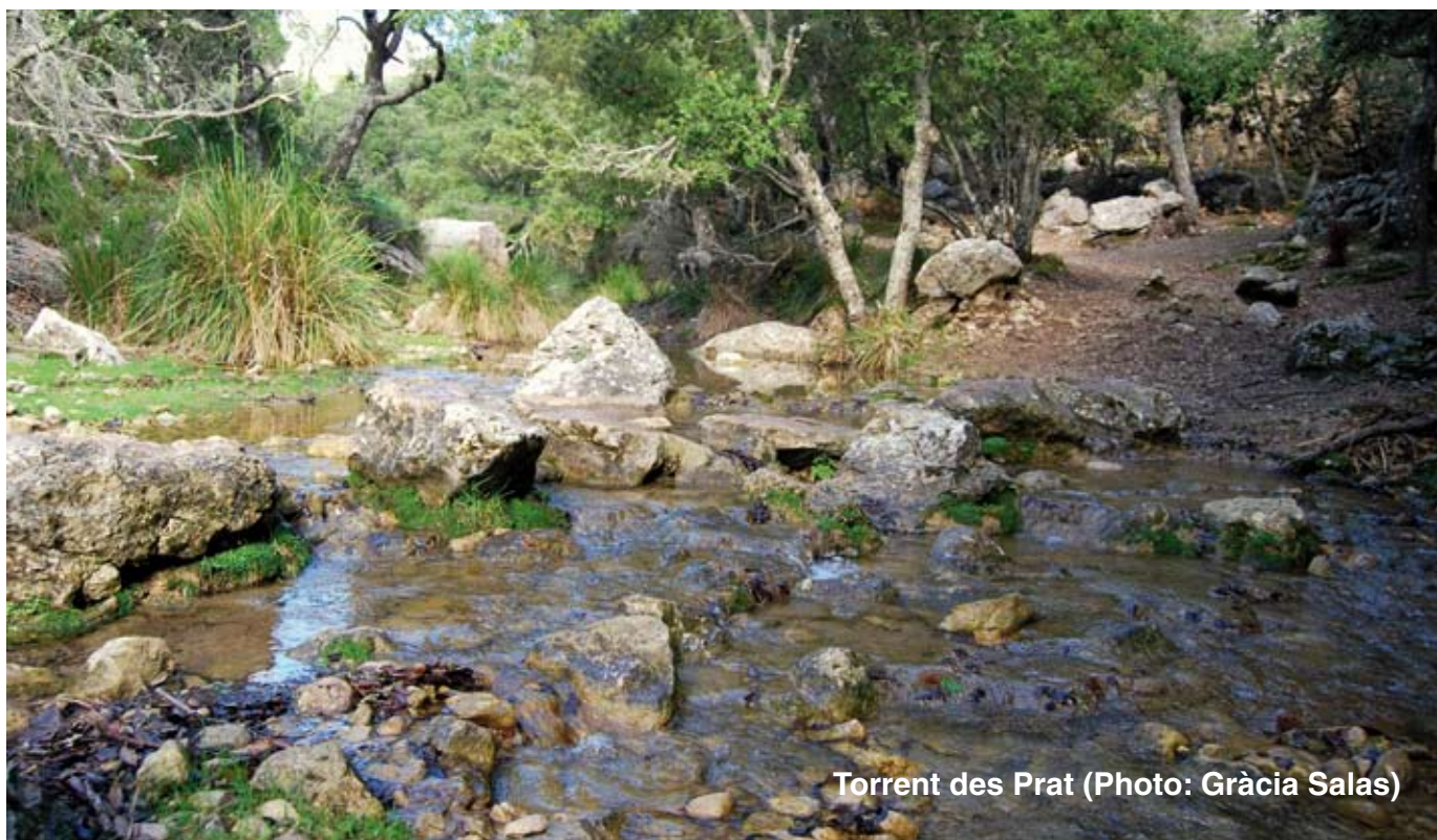
Torrent des Prat

You will soon cross over the stream again, this time via a wooden bridge. Next, head uphill until you reach a crossroads. If you wish, you can take a momentary detour from your trail to visit the Font des Prat de Massanella, an ever-flowing spring with a gallery that connects with the Canaleta de Massanella water channel.