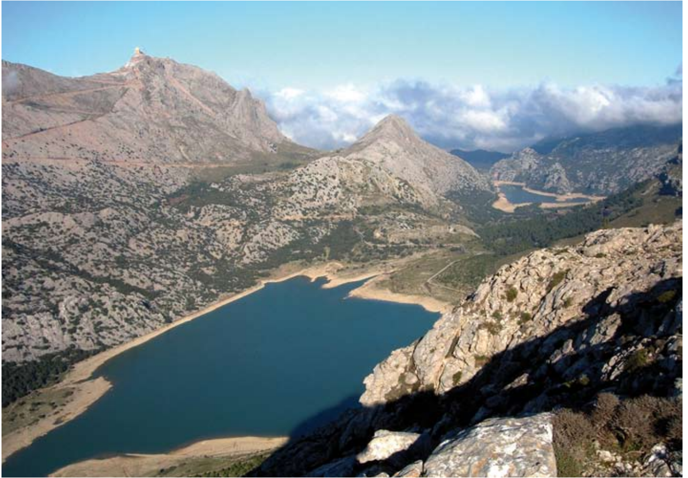
Cúber and Gorg Blau Reservoirs

Llibre del repartiment (“Book of Distribution”), as having an extension of fifteen jovades (a jovada was equivalent to approximately 11.36 hectares).