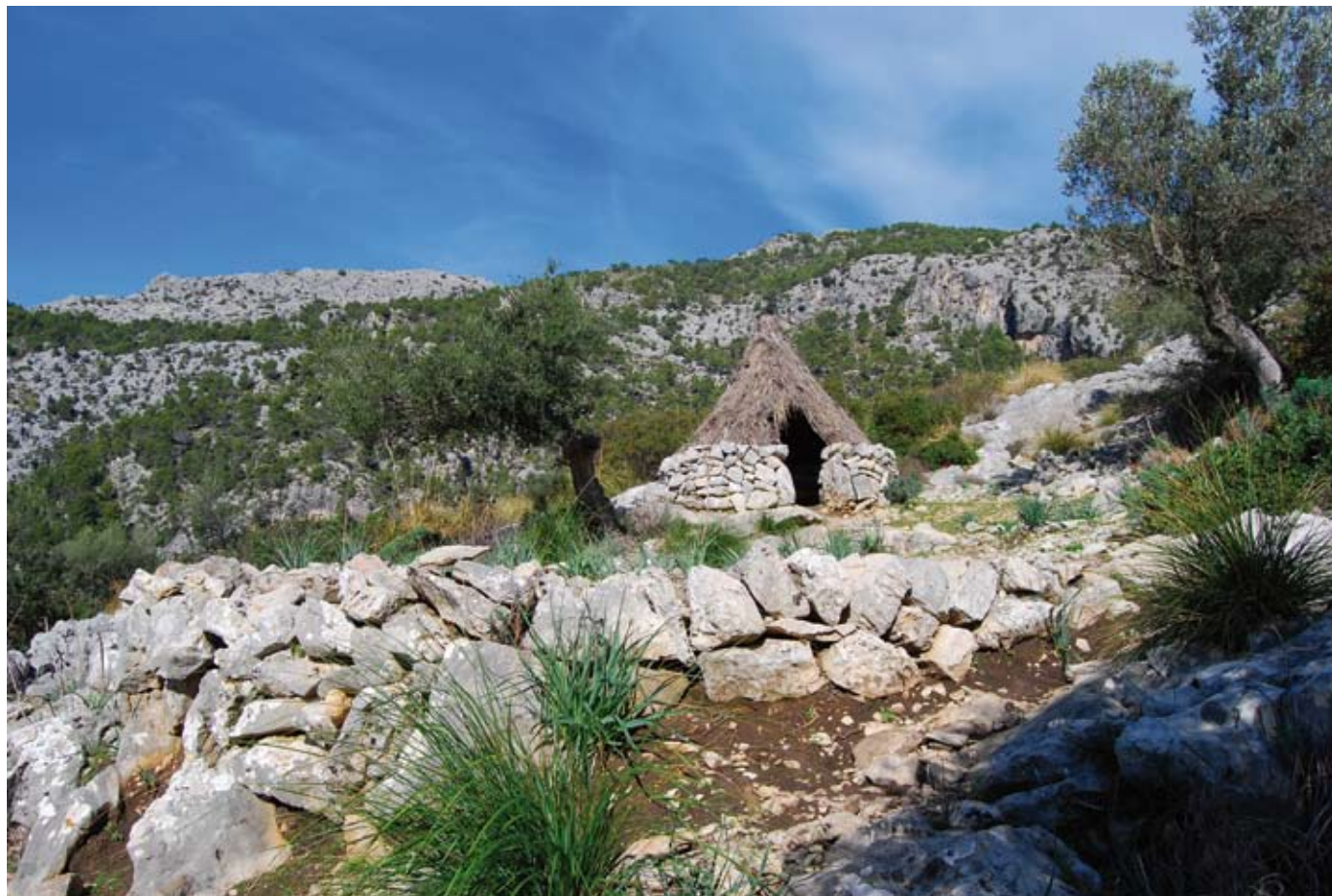
Charcoal production floor and wood collier's shack

The Tossals Verds Refuge, which is managed by the Consell de Mallorca, invites you to take a break. Once you have recovered, follow the signs of the GR-221 towards the spring, Font des Noguer. On the left-hand side of the refuge, you will see the stone-paved path that leads up to an open area, where the old houses, or Cases Velles des Tossals , are located. Yet before you get there, you will pass by a round charcoal production floor ( rotlo de sitja ), where charcoal was once made, and a small shack covered with Mauritanian grass ( A. mauritanica ), which housed the wood collier and his family.