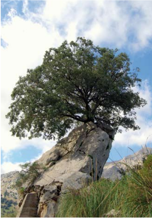
Holm oak

When you return to the trail, you will see a sign indicating the way to the Coll dels Coloms pass. Here, you may take a detour to visit the summit Puig des Tossals Verds (1120 m). However, your proposed itinerary will take you to a cement channel, an example of hydraulic engineering that transfers water from the Gorg Blau lake to Cúber. Once again, you will enjoy the breathtaking views of the reservoir and the peaks of Puig Major, Puig de ses Vinyes and Morro d'Almallutx. At this point, you are not far from the end of the itinerary.