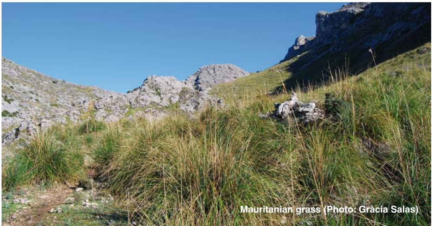
Mauritanian grass

Shortly before you reach the Llis pass, you may wish to stop to look at the local box tree ( Buxus balearica ). This is a surviving member of a plant species that abounded here in the past. Currently listed in the Balearic Catalogue of Endangered Species and Special Protection, this tree can be identified by its shiny oval leaves, which, pale green in colour due to the effects of the wind, take on reddish tones in the summer. The hard, dense wood of this tree was once highly valued for its use in making spoons and even fine furniture.