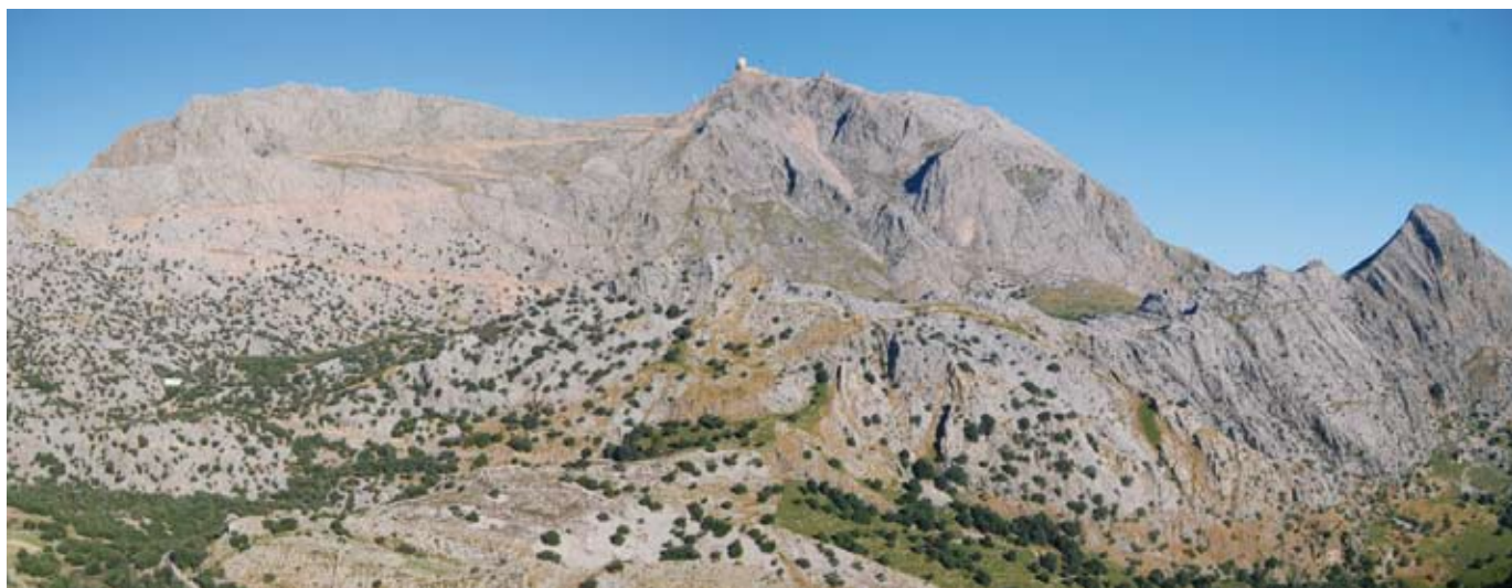
View of the peaks Puig des Migdia, Puig Major and Puig de ses Vinyes from the reservoir channel

close to your starting point. Before you get to the Font des Noguer spring, you will not want to miss the view of the solitary holm oak that sits overlooking the mountains.