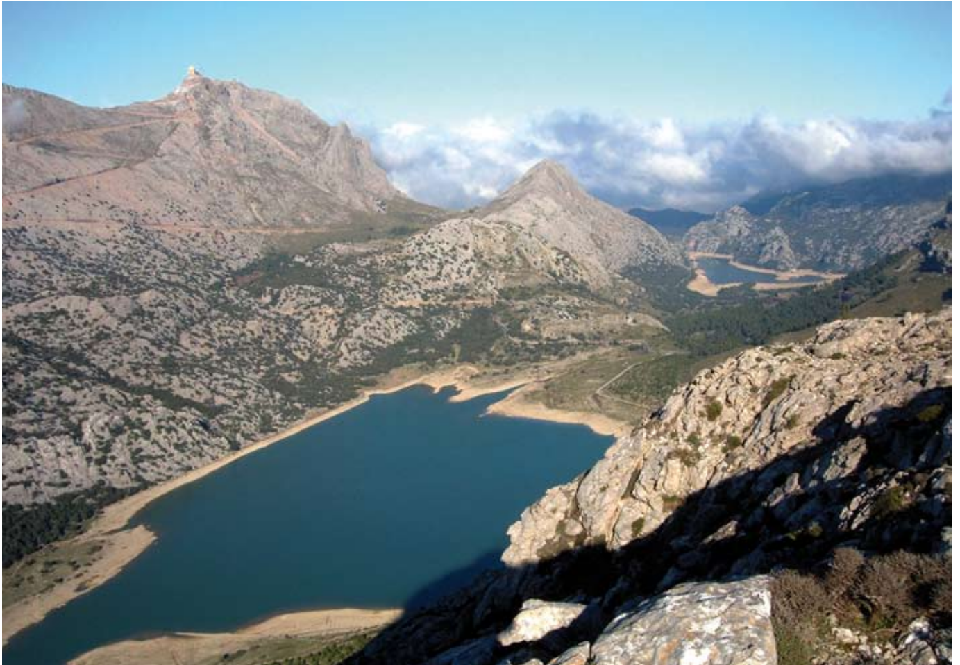
Cúber and Gorg Blau Reservoirs

Llibre del repartiment (“Book of Distribution”), as having an extension of fifteen jovades (a jovada was equivalent to approximately 11.36 hectares).