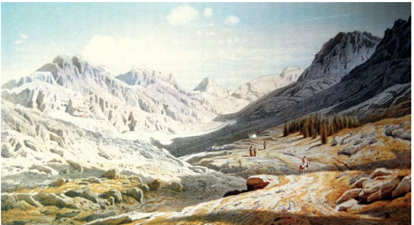
View of Penyal del Migdia, Puig Major and Puig de ses Vinyes from the Coma des Ases pass

Following the conquest of Mallorca by King Jaume I, the king set aside the land of the Muntanyes or mountain area, for himself, which he distributed among the participants of his conquest. This land is described in the corresponding