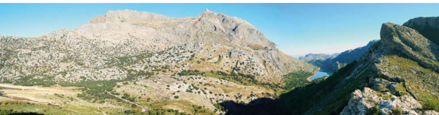
View of Penyal del Migdia, Puig Major and Puig de ses Vinyes from the Coma des Ases pass.