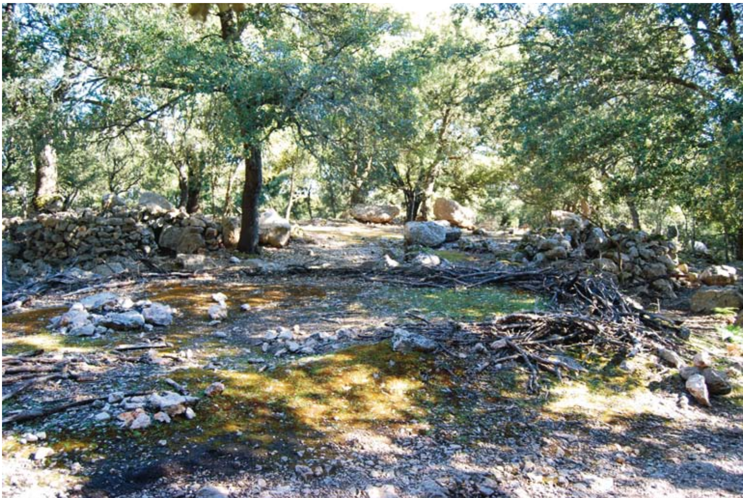
Charcoal production floor with two sheds in the woods of Son Macip

The Font Coberta marks the start of the old road to Sóller ( Camí de Sóller ), which today is signposted as GR-221. It is a stone-laid bridle path that runs up through the forest of Ca s'Amitger until it reaches the Andratx – Pollença highway (Ma – 10). Here you will cross the highway and continue on the other side, along a wider path. Once past a gateway, you will enter the holm oak forest of the Son Macip public estate, one of the most emblematic estates in the Serra de Tramuntana, where you will see charcoal production floors and small sheds virtually all along the trail. These structures bear witness to the intense charcoal production activity that once inhabited these emblematic woods.