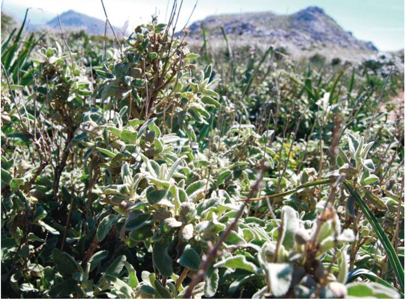
Jerusalem sage, with the Puig d'en Galileu in the background

After resting for a while next to the Cases de neu ( icehouse complex ), you will return to the trail to head over to another pass, where the landmarks fork off. Here, you will turn to the left to climb up to the top of Puig d'en Galileu. Particularly abundant along this section of the trail is the Jerusalem sage ( Phlomis italica ).