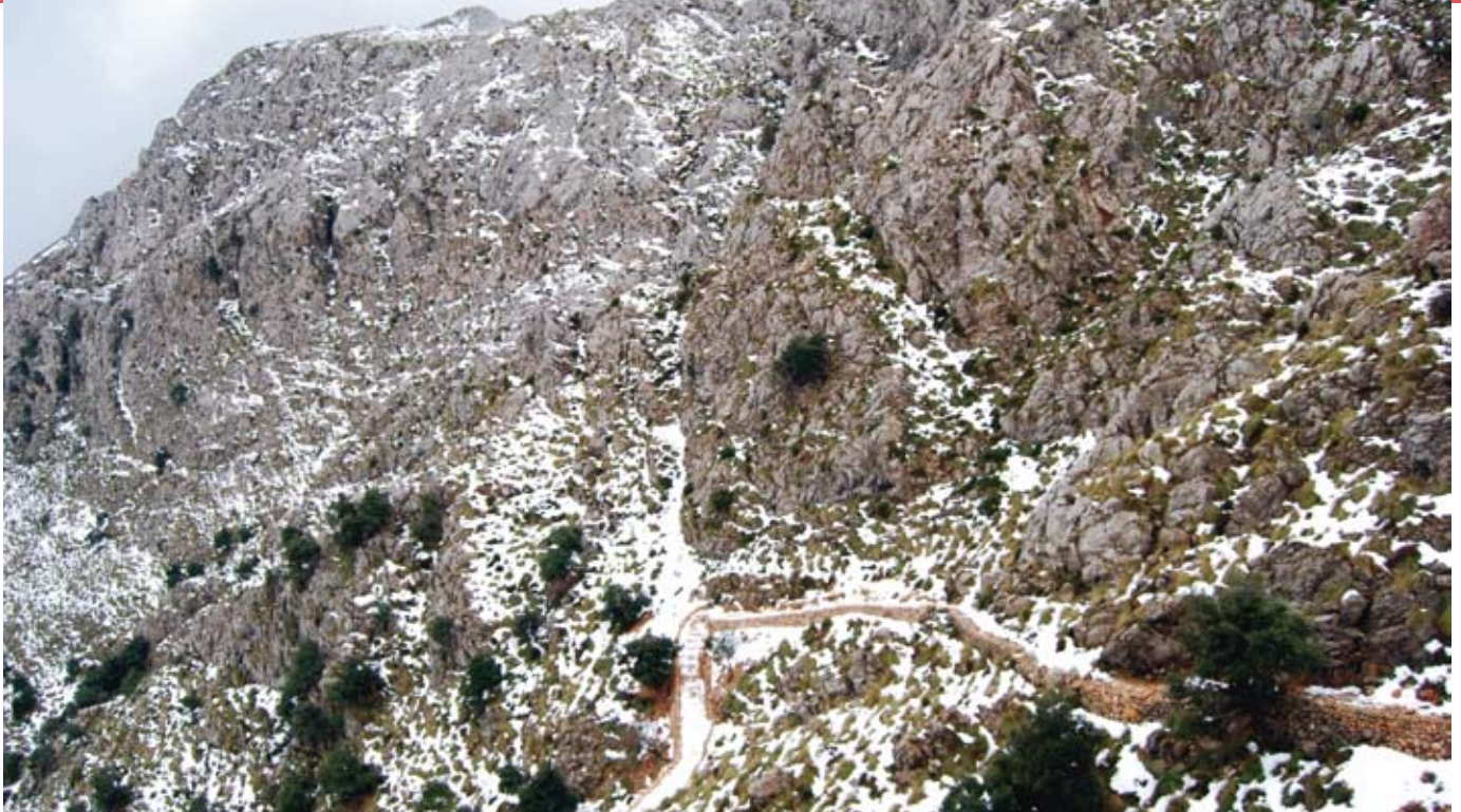
Ses Voltes d'en Galileu, covered in snow

This narrow road ends at the foot of an area known as Ses Voltes d'en Galileu. The name of this zone makes reference to the curves ( voltes ) in the road, which compensate for the 250-metre change in elevation and the nickname of the man who built it, Antoni Català «Galileu», who in 1692 undertook the task of “making and rebuilding some icehouses on the mountain known as La Mola, located in the Lluc or Scorca area”.*