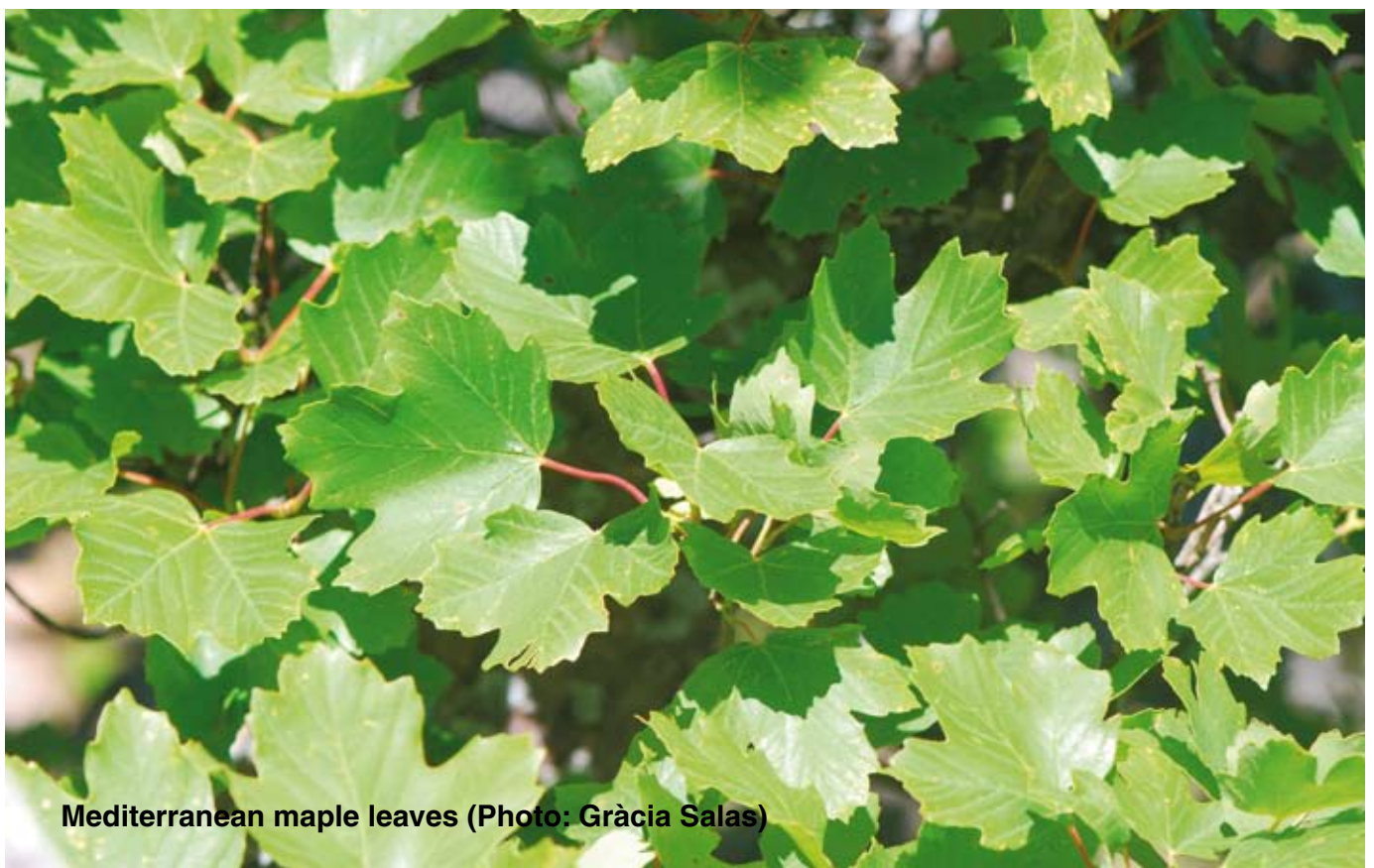
Mediterranean maple leaves

At this point, you will retrace your path back down the mountain. When you reach the place where the landmarks forked off, you will turn to the right until you come to the plateau, where you will once again take the curved trail of Ses Voltes downhill. This time, however, the path is sure to seem shorter than it was on the way up!