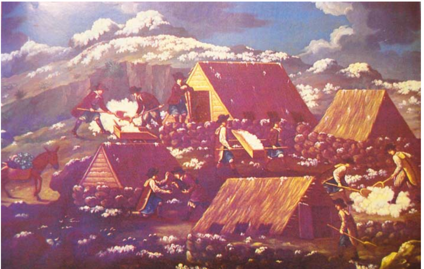
The icehouse keepers of Massanella, painting by Jaume Nadal (1750), conserved in the houses of Massanella.

The fact that the icehouse keeper’s work survived in Mallorca until the first quarter of the 20th century has enabled the survival of some of the old icehouse work songs.