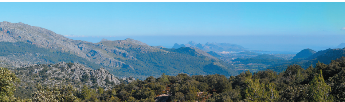
View of the Bay of Pollença from the pass Collet de Binifaldó