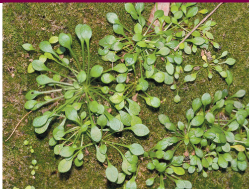
False daisy

Before setting out again on the trail, you may wish to have a close look at a small plant that tends to grow in rather damp places such as this one: the false daisy ( Bellium bellidioides ). It is small, and unless you are here in the springtime, you probably will not see it in bloom. You may have to kneel down to appreciate the rounded form of its leaves, which are clustered in a rosette shape at the plant's base.