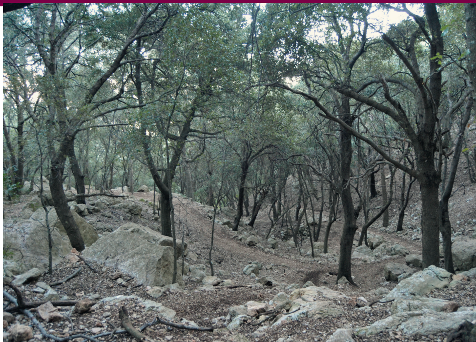
The path through the holm oak forest

As you enter the holm oak grove, you are sure to be surprised by the almost absolute lack of undergrowth.