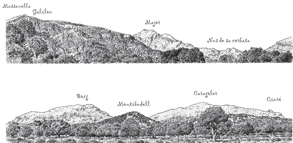
Relief of the mountains (Drawing: Vicenç Sastre)

Starting beneath the porxets, (pilgrims' cells) of the Lluc Sanctuary, you will come to an arched doorway. Go through it and take the asphalted path alongside the stream, which will be on your left. A few metres ahead, turn off to the left until you come to a football field. Passing by a small wooden bridge that will be on your left, you will continue along the old Roman highway that once connected Lluc with Pollença. Follow this ancient thoroughfare for a while until you reach the Andratx – Pollença highway (Ma-10). Here, turn to the left and continue 120 m, until you come to an asphalted road signposted with the welcome signs to the public estates of Menut and Binifaldó. Just past the signs, take the asphalted road amid holm oaks and rocky formations, reaching the houses of Menut. Leaving the houses behind you on the right, you will continue along the path until you come to the Binifaldó Environmental Education Centre, which you will once again leave behind on the right, as you set out down a wide unpaved trail that runs alongside the dry stone wall that marks the enclosure of the grain fields near the houses.