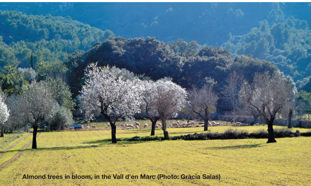
Almond trees in bloom, in the Vall d'en Marc

The almond tree, in bloom is a wedding veil, and for the damsel, The open sky before her soul.