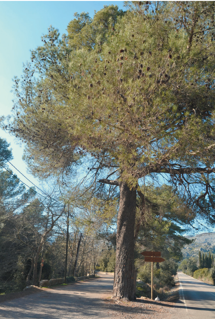
Pi de Son Grua

And finally, Balaixa and Ben-Nassar were wed. The town of Pollença has a street named after Balaixa.