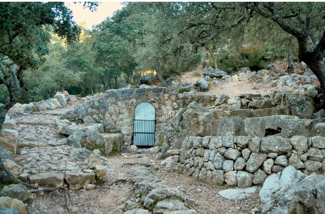
Font de Muntanya

A light uphill climb will bring you to the pass known as Collet de Binifaldó (598 m), where you will enjoy a magnificent view of the Bay of Pollença. On a clear day, you might even make out the silhouette of the island of Menorca.