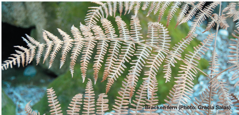
Bracken fern

Nevertheless, this belief, which was noted in the Rondaies mallorquines (Mallorcan Folktales) by Mossen Alcover, has no scientific basis at all, as ferns reproduce via the spores that are found on the undersides of their leaves.