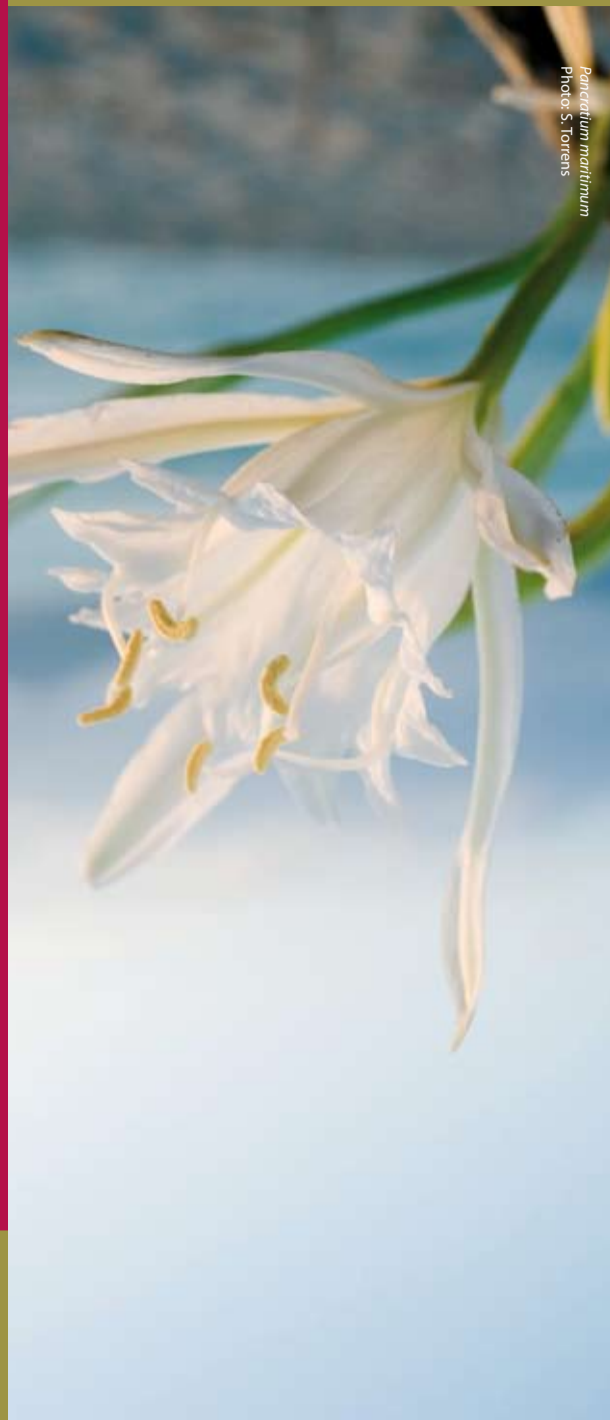
Paracatium maritimum

Reserva natural de S'Albufereta Lista de Correos E-07458 Can Picafort 07458 · Mallorca Tel. 971 89 22 50 · Fax 971 89 21 58 reserva.albufereta@gmail.com