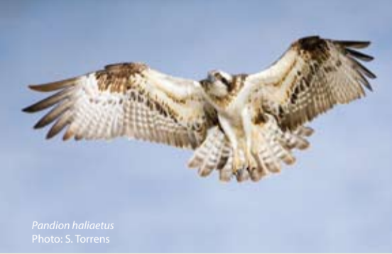
Pandion haliaetus

Like other Mediterranean wetlands, S'Albufereta is an essential sanctuary along the annual migratory paths of countless aquatic birds. Moreover, during the harsh summer droughts that typify the Mediterranean climate, wetlands like S'Albufereta become genuine oases for many bird species.