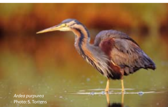
Ardea purpurea

The Nature Reserve covers a surface of 211 hectares, with additional peripheral protection of its surrounding 290 hectares, where certain land use and activities are regulated to prevent unwanted environmental impact.